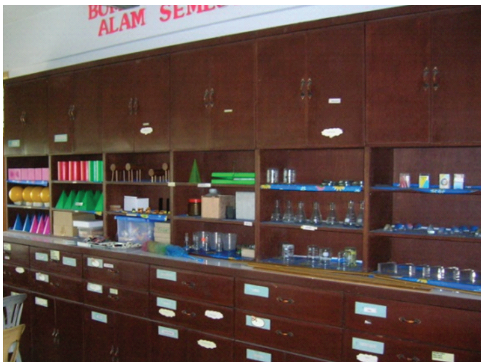
Plate 1. Science Laboratory, SMK Kompleks Uda, Johor: