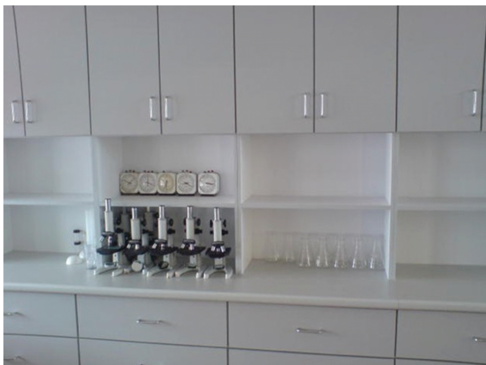
Plate 2. Science Laboratory, SK Dumpar, Muar, Johor: