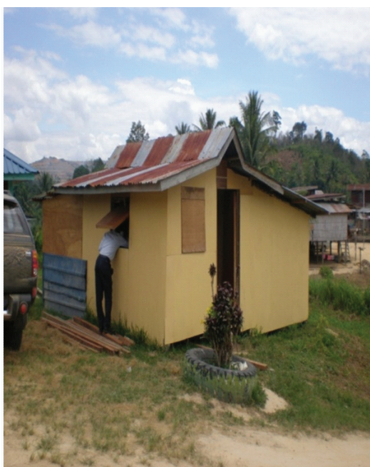
Plate 5. Teacher's quarters, SK Inandung Keningau, Sabah.

Upon arrival, the teachers often found the school and teacher housing in a deplorable state ( Plate 5 ). There was an obvious pressing need for providing decent teacher's quarters and for improving the quality of current existing quarters. Sanitation and the minimum hygiene standards of a flushing toilet was a luxury. The school facilities such as science rooms, computer rooms, internet connection and supplies were sad to say, most of the time not available. The very basic amenities of clean water and electricity were sometimes not provided or the supply was intermittent. Of course, even rudimentary health and medical care was absent. By then, most of the teachers would be already demoralized and devastated and wanted to be moved out. This had resulted in a high turnover rate of teachers posted to Sabah alone (1200 per year). In a small-sample survey conducted during the second workshop [See Volume 3], close to 60% of the teachers said they had served less than 10 years in Sarawak, whereas the percentage was 40% in Sabah. These numbers indirectly reinforced the relative high turnover rate of teachers in the states.