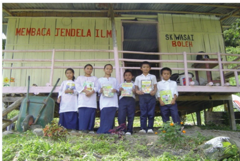
Plate 6. School without electricity supply, SK Wasai, Tuaran, Sabah.

These isolated schools ( Plate 6 ) were often cut off from civilization in the sense that without electricity and without proper access roads or waterways, there was practically no convenient means of regular communication with the outside world, in particular telecommunication. Not only telephone lines were not available but also hand-phones which were ubiquitous in this modern era were out of the operation range. It was thus understandable why teaching and learning through the electronic media using the ICT approach could not be implemented there in the rural setting.