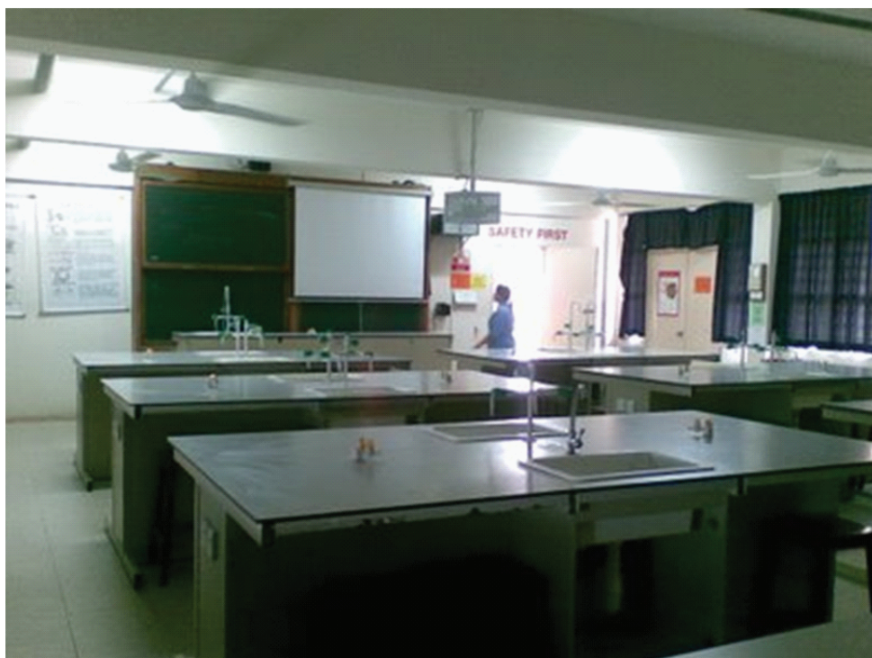
Plate 3. Science Laboratory, SMK Pujut, Miri, Sarawak.

It was highlighted the hardware (PC, LCD and notebooks) was frequently outdated, malfunctioning and even without functioning batteries. There was no regular maintenance and upgrading of equipment, while not all schools were provided with computers.