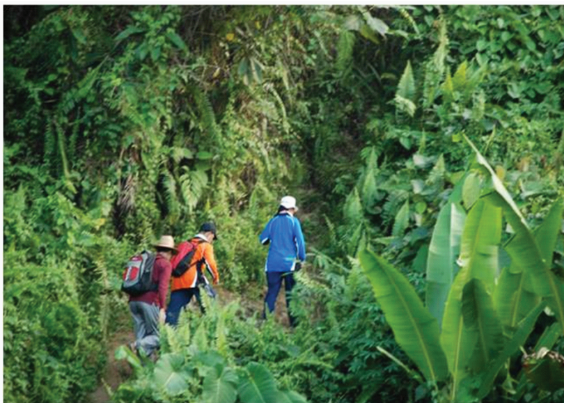
Plate 4. Journey to school through jungle track, SK Saliliran, Nabawan.

Upon arrival, the teachers often found the school and teacher housing in a deplorable state ( Plate 5 ). There was an obvious pressing need for providing decent teacher's quarters and for improving the quality of current existing quarters. Sanitation and the minimum hygiene standards of a flushing toilet was a luxury. The school facilities such as science rooms, computer rooms, internet connection and supplies were sad to say, most of the time not available. The very basic amenities of clean water and electricity were sometimes not provided or the supply was intermittent. Of course, even rudimentary health and medical care was absent. By then, most of the teachers would be already demoralized and devastated and wanted to be moved out. This had resulted in a high turnover rate of teachers posted to Sabah alone (1200 per year). In a small-sample survey conducted during the second workshop [See Volume 3], close to 60% of the teachers said they had served less than 10 years in Sarawak, whereas the percentage was 40% in Sabah. These numbers indirectly reinforced the relative high turnover rate of teachers in the states.